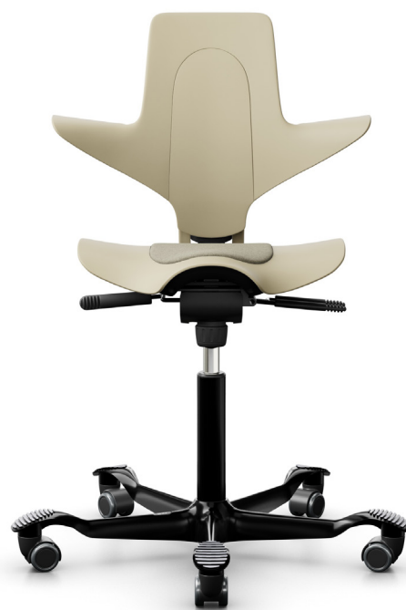
Design: Peter Opsvik. Patent- and design protected.